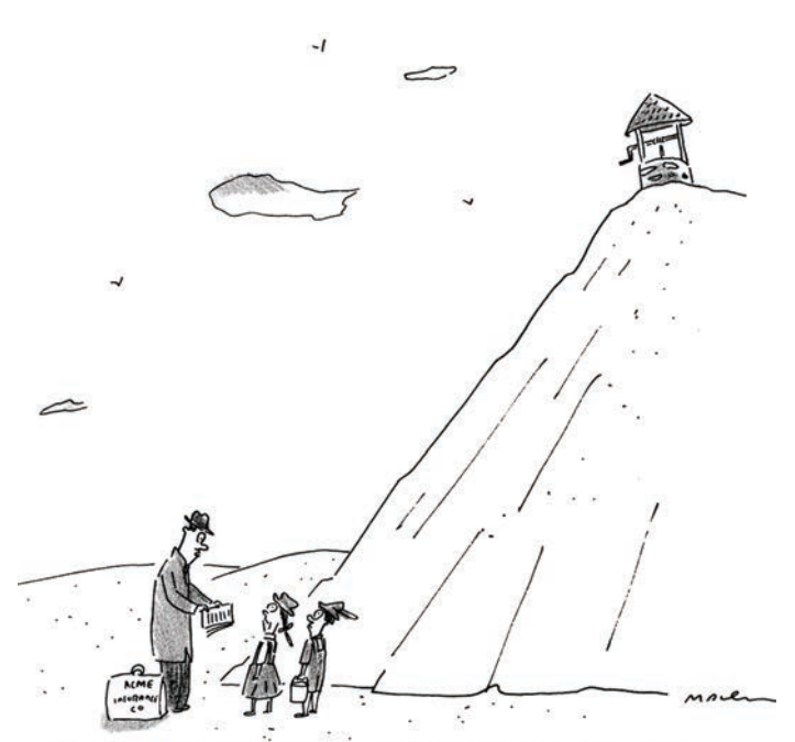
"Let's just say you both went up this hill to fetch a pail of water, then Jack fell down and broke his crown, and you, Jill, came tumbling after. With this policy, you'd be covered for that."

again, and considering options to facilitate procedures for those interested in charitable giving directly from their IRAs. We are at the stage of monitoring, and avoiding tumbling, if too little is withdrawn before year end.