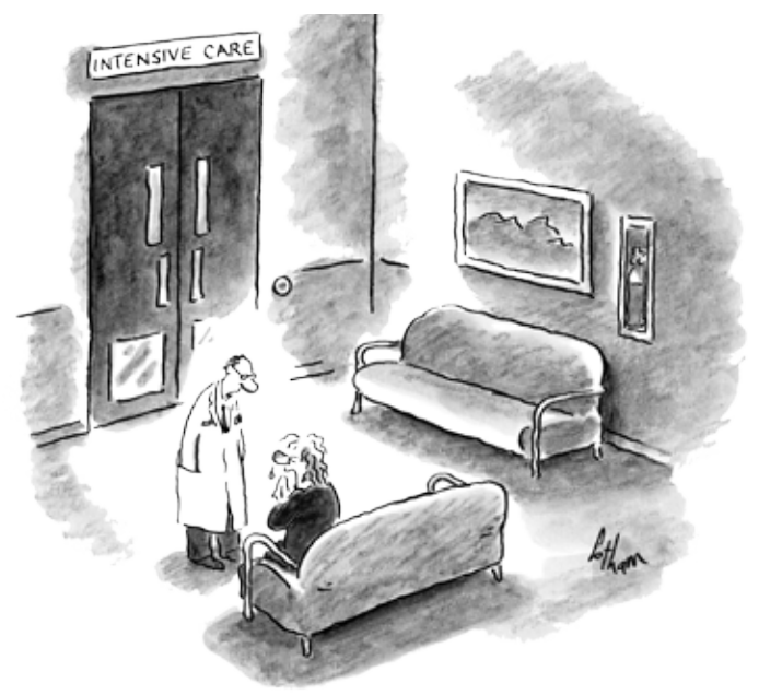
"The I.R.S. can't hurt him anymore."

P.S. As I was adding the finishing touches to this newsletter, one of our trust officers was unavailable. She just received a tax deficiency tax letter asking for approximately $34,000. The IRS once again was wrong. She aged another year nonetheless.